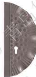
63, 102, 02 275x130 3