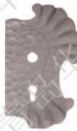
Code No. 63.120 mm 275x160 T(mm) 3