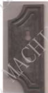
Code No. 63.130 mm 275x115 T(mm) 2