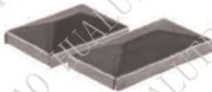
Code No. 62,005,01 H (mm) 30 L (mm) 20