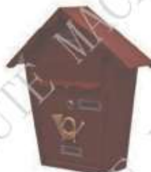
Code No. 65,003 spec 370x375x110 T(mm)