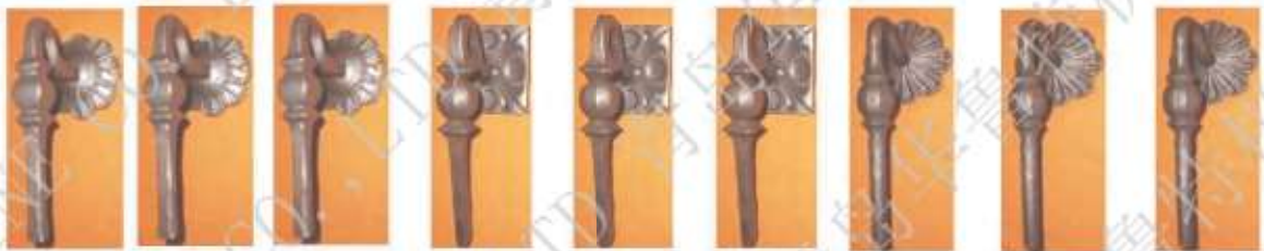
Code No. 63, 031A 63, 031B 63, 031C 63, 032A 63, 032B 63, 032C 63, 033A 63, 033B 63, 033C Spec. mm \blacksquare 12 \blacksquare 14 \blacksquare 16 \blacksquare 12 \blacksquare 14 \blacksquare 16 \Phi 12 \Phi 14 \Phi 16 90 \pm \Phi 95mm 90 \pm \Phi 95mm 90 \pm \Phi 95mm 90 \pm \blacksquare 80mm 90 \pm \blacksquare 80mm 90 \pm \blacksquare 80mm 90 \pm \Phi 95mm 90 \pm \Phi 95mm 90 \pm \Phi 95mm