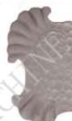
63, 117 275x160 3