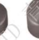
62,060 ∅ 60