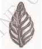
Code No. L-01 size 115*55 Material. 0.85 T(mm).