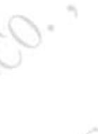
62,005,08 30 60