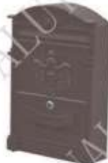
Code No. 65,002 spec 420x260x85 T(mm)