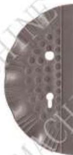
63, 102 275x130 3