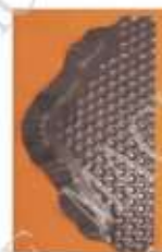
Code No. 63.140 mm 300x165 T(mm) 2