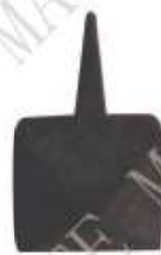
Code No. 86028 size 30x4/20x20