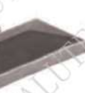
62,005,03 40 30