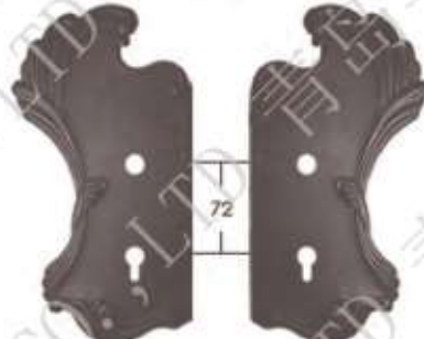
Code No. 83,161,01 83,162,01 size 330x175 330x175 T(mm) 3 A; 72 3 A; 72