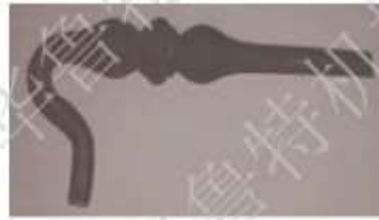
63, 031 \Phi 14