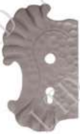
Code No. 63.119 mm 275x160 T(mm) 3