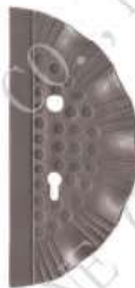
63, 103 275x130 3