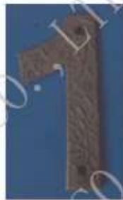
Code No. 89.001 size 100x45