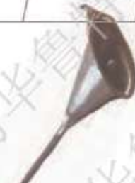
Code No. C-011.01 size 75*90 \phi 12, 7 L. 455 1