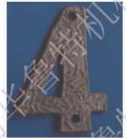
Code No. 89.004 size 100x60