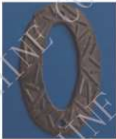
Code No. 89.000 size 100x60