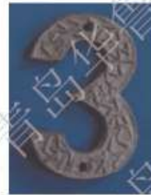
Code No. 89.003 size 100x60