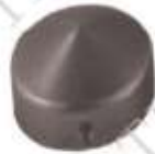
62,051 ∅ 51