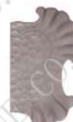
63, 118 275x160 3