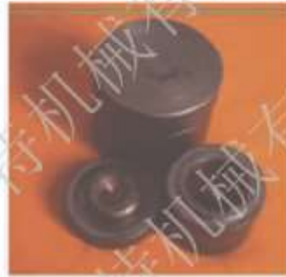
Code No. C-020 size \phi 50