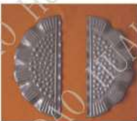
Code No. 63.136 mm 210x95 T(mm) 2