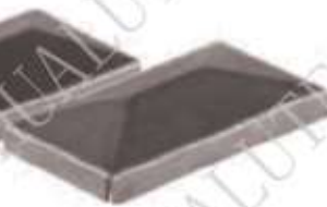
62,005,02 40 20