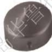
62,077 ∅ 77