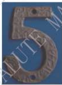
Code No. 89.005 size 100x65