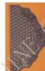
Code No. 63.141 mm 300x165 T(mm) 2