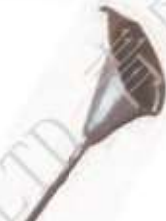
Code No. C-011 size 340 1