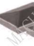
62,005,05 60 40