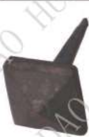
Code No. 86017 size 35x5/28x28