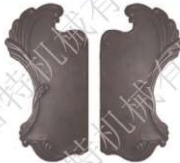
Code No. 83,161 83,162 size 330x175 330x175 T(mm) 3 3