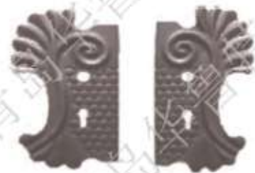
Code No. 83,182 83,183 size 290x180 290x180 T(mm) 2 A=72 2 A=72