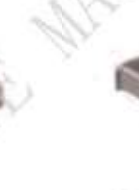
62,005,04 50 30