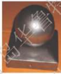
62,010,08B □ 100X100 ∅ 80