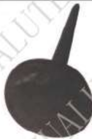
Code No. 86016 size 45x6/ 30