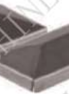
62,005,06 80 40