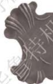
Code No. 63.125 mm 270x165 T(mm) 2