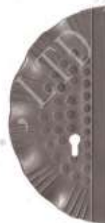
63, 102, 01 275x130 3