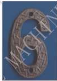
Code No. 89.006 size 100x60