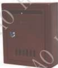
Code No. 65,001 spec 270x200x80 T(mm)