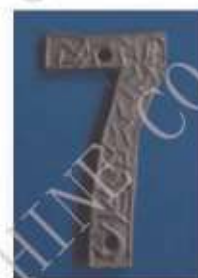
Code No. 89.007 size 100x60