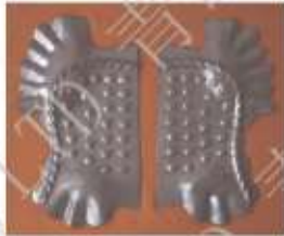
Code No. 83,142 83,143 size 260x160 260x160 T(mm) 2 2