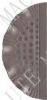
Code No. 63, 101 mm 275x130 T (mm) 3