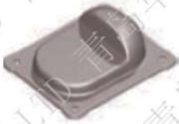
Code No. 63, 030, 01 Size 2 H120xL100