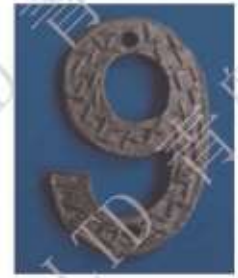
Code No. 89.009 size 100x60