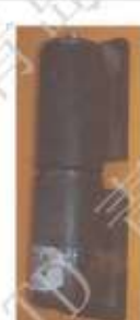
Code No. 64,007 size ●38x165 base 1-3/8" x3" T t: 1/2"