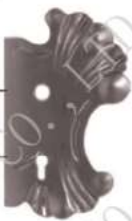
Code No. 63.128 mm 275x165 T(mm) 3 A=72