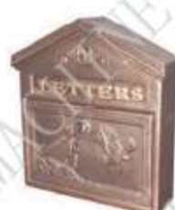
Code No. 65,004 spec 340x315x85 T(mm)