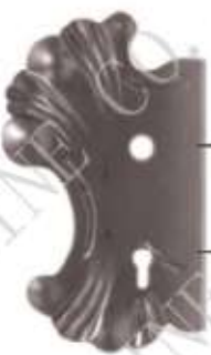
Code No. 63.127 mm 270x165 T(mm) 2 A=72