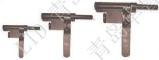
Code No. C-013 size 150x125