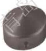
62,072 ∅ 72