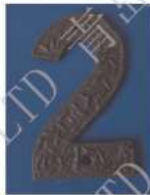
Code No. 89.002 size 100x65