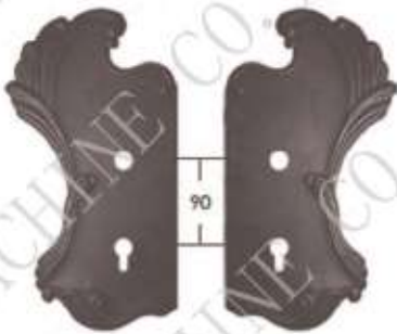
Code No. 83,161,01 83,162,01 size 330x175 330x175 T(mm) 3 A; 90 3 A; 90