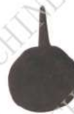
Code No. 86026 size 30x4/ 20