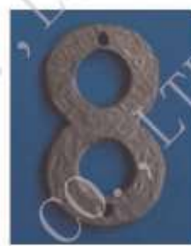
Code No. 89.008 size 100x60