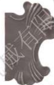
Code No. 63.126 mm 270x165 T(mm) 2