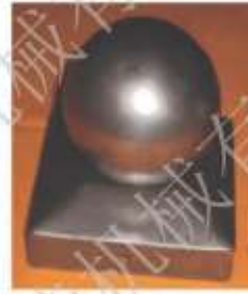
62,012,095B □ 120X120 ∅ 95