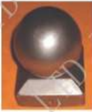
Code No. 62,008,08B Size □ 80X80 ∅ 80