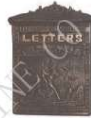
Code No. 65,005 spec 365x330x100 T(mm)